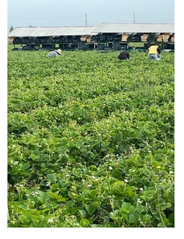
Strawberry field and farmworkers working at Good Farms, Oxnard

The idea is for the cool water to stay at 59°F (recommended by CalOSHA/NIOSH) and to be easily accessible to farmworkers throughout their work shift.