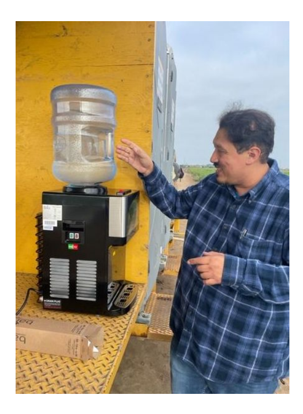
Testing the water cooler prototype.