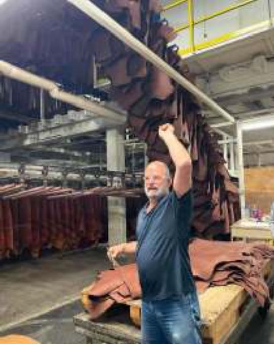
The first stop in this four day retreat was to the S.B. Foot Tanning Company in Red Wing, Minnesota.