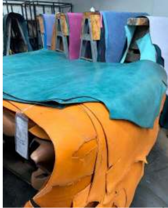
The complexity of what it take to create a beautiful leather hide that is used for foot wear, fashion accessories, clothes, etc. is very impressive!